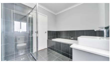
LOT 642 43 Respect Way, Marigold, Tarneit House Size 20sqs Land Size 333m²(CNR)